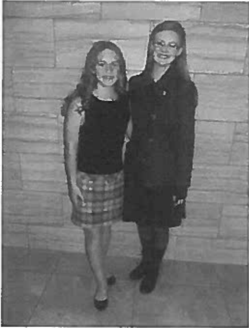
November, 2016 Ohio MIWW representatives to Denver, Colorado

Junior and Senior Division winners will Advance to National Finals to be held in San Antonio, Texas, January 31-February 3, 2018